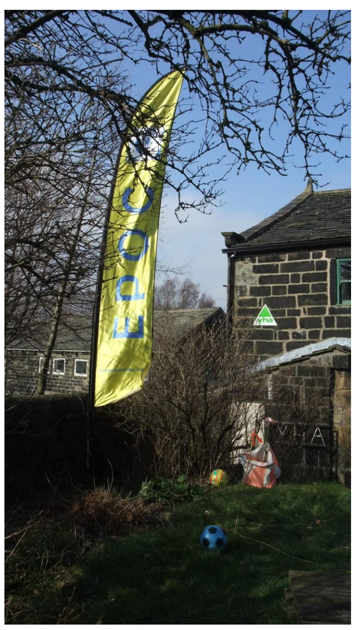
Spring arrived just in time for Stoodley Pike